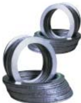
石墨垫圈 Graphite Gasket