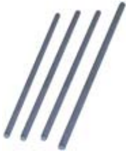
石墨搅拌棒 Graphite Stirring Rod