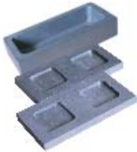
石墨油槽(订制) Graphite Ingot Mould ( Tailored )