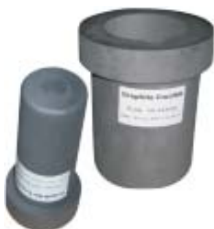
石墨双环熔金坩埚 Graphite melting crucible with neck