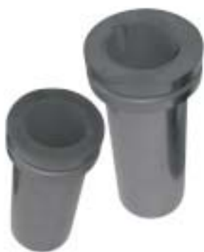
石墨双环熔金坩埚 Graphite melting crucible with neck