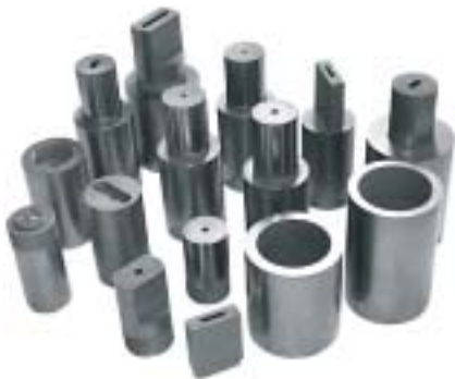
石墨模具(订制) Graphite mould ( can be customied )