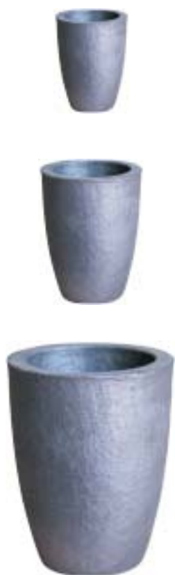
石墨粘土坩埚 Clay-graphite crucibles